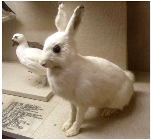
Fig. 5. A mounted specimen of the mountain hare ( Lepus timidus ) deposited in the SMB collection (in protocol cards with No. 40/71).

Рис. 4. Опудало самця зайця сірого з колекції Музею Шаріша з аномальним забарвленням хутра (під № 550/59 в облікових картках з позначкою «альбінос»).