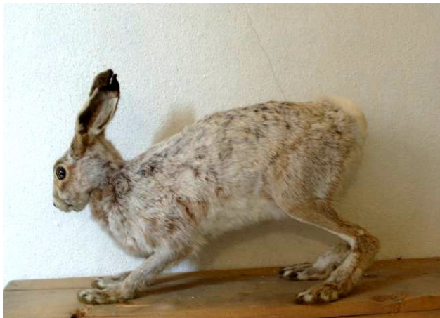
Fig. 4. A mounted male of the brown hare deposited in the SMB collection with anomalously coloured fur (in protocol cards with No. 550/59 stated as “albino”).

Рис. 3. Тушки зайця сірого ( Lepus europaeus ) у колекції Музею Шаріша в Бардейові.