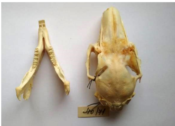
Fig. 6. Skull of the mountain hare ( Lepus timidus ) deposited in the SMB collection (in protocol cards with no. 40/71).

Рис. 5. Опудало зайця білого ( Lepus timidus ) з колекції Музею Шаріша (під № 40/71 в облікових картках).