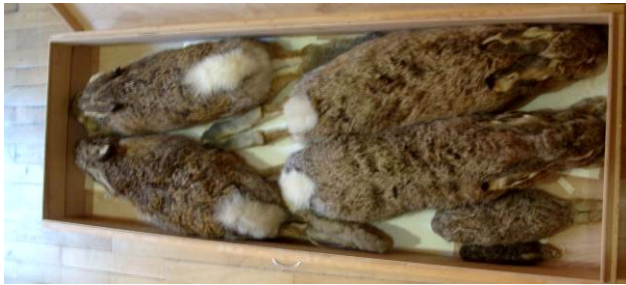
Fig. 3. Study skins of the brown hare ( Lepus europaeus ) deposited in the SMB collection.

melanism (Hell 1972). Similarly, one specimen of the mountain hare ( L. timidus ) in typical winter fur is also present in the SMB collection. This specimen is displayed as a skin-mount in the public exhibition (Fig. 5) and its skull stored in the museum deposit (Fig. 6).