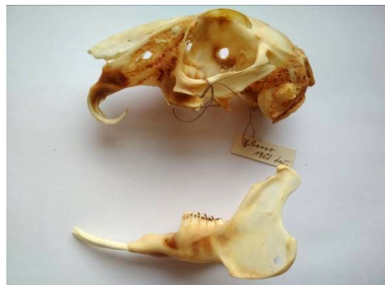
Fig. 7. Skull of the brown hare ( Lepus europaeus ) deposited in the SMB collection with anomalous dentition.

Рис. 6. Череп зайця білого ( Lepus timidus ) з колекції Музею Шаріша (під № 40/71 в облікових картках).