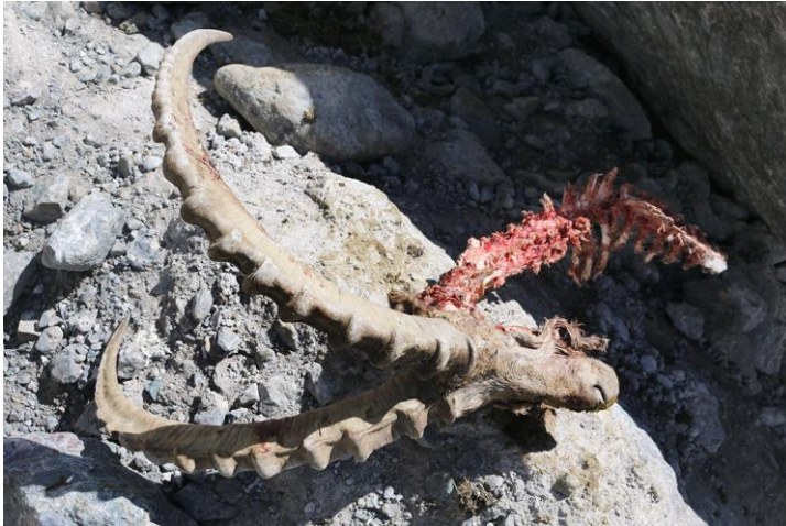
Fig. 3. Snow leopard kill of a Siberian ibex (25 th August 2016, altitude 3560 m).