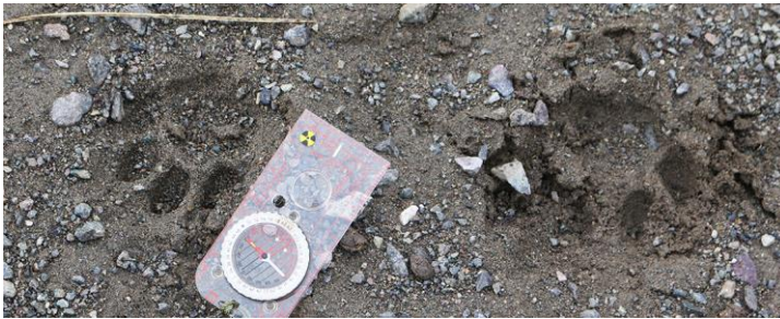
Fig. 2. Snow leopard pugmarks (11 th August 2016, altitude 3562 m).