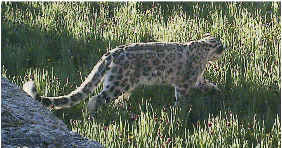
Fig. 6. Evening (zoomed) camera trap record of a snow leopard (15 th of July 2019, 19:50 PM), altitude 3512 m.

Рис. 5. Нічний знімок снігового барса, зроблений фотопасткою, висота 3720 м).