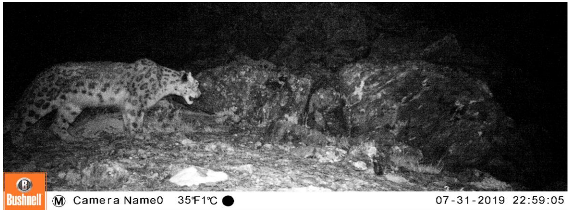
Fig. 5. Nighttime camera trap record of a snow leopard, altitude 3720 m.

Рис. 5. Нічний знімок снігового барса, зроблений фотопасткою, висота 3720 м).