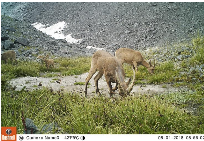
Fig. 4. Camera trap record of Siberian ibex next to the site where the kill was discovered in 2016.