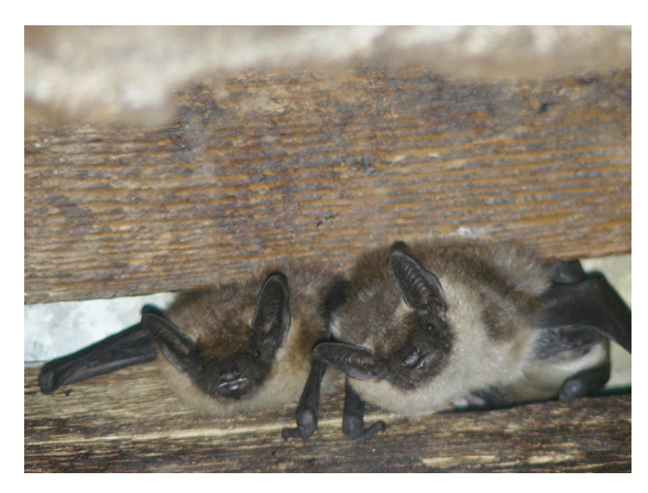
attic, Volosianka village.

Рис. 1. Фрагмент колонії Eptesicus serotinus на дахові церкви у с. Волосянка.