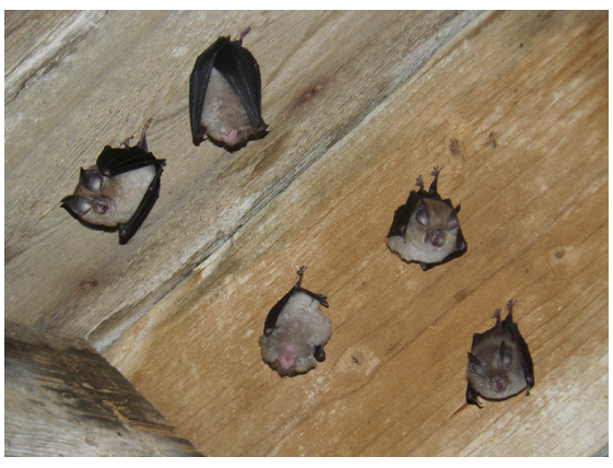
Fig. 1. A part of Eptesicus serotinus colony in a church Fig. 2. A colony of Rhinolophus hipposideros in a church attic, Tykhyi village.

Рис. 1. Фрагмент колонії Eptesicus serotinus на дахові церкви у с. Волосянка.