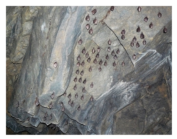
N 1 near Zahorb village.

Рис. 3. Колонія Rhinolophus hipposideros в штоль- Рис. 4. Колонія Myotis myotis в печері на г. Красія в ні № 1 у с. Загорб.