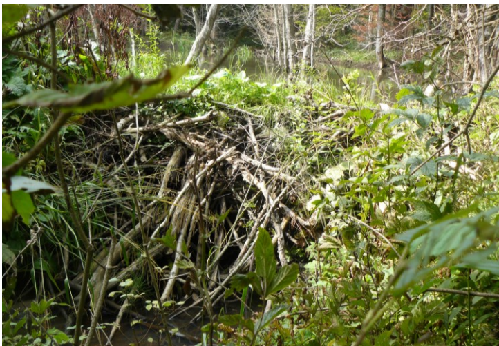
Fig 4. The highest beaver dam (2.5 m) in vicinities of Uzhok village (August 2013).

Рис. 3. Боброве поселення в окол. с. Ужок (серпень 2013 р.)