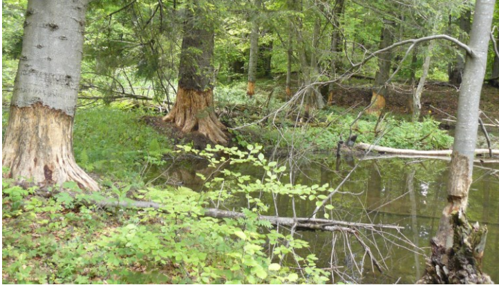
Fig 3. A beaver settlement in vicinities of Uzhok village (August 2013).

Рис. 3. Боброве поселення в окол. с. Ужок (серпень 2013 р.)